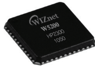
48 Pin QFN Package (7mm x 7mm)

The W5200 chip is a Hardwired TCP/IP embedded Ethernet controller that enables easier internet connection for embedded systems using SPI Interface. By using SPI Interface, the decreased footprint size enables easier implementation for smaller embedded systems. The Hardware TCP/IP stack that is being used in W5200 has been certified throughout years in many applicable fields and provides network protocols such as, TCP, UDP, IPv4, ICMP, ARP, IGMP, PPPoE, and etc. The W5200 chip has both Ethernet MAC and PHY embedded inside; providing all necessary solutions for internet connection. Also, for energy related applicable fields, W5200 provides Power Down mode; minimizing energy consumption.