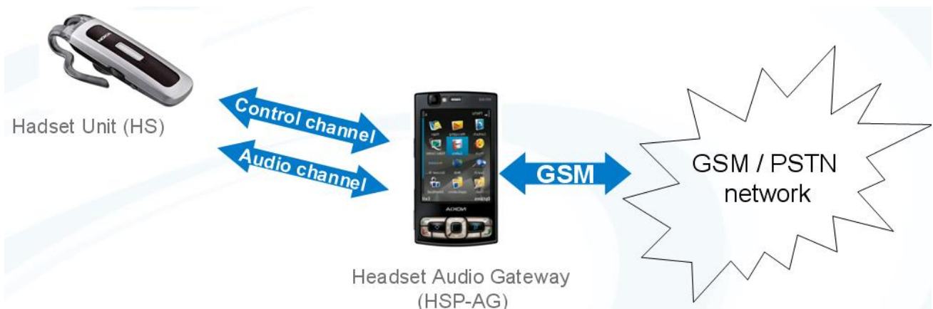
Figure 2: Typical HSP use case

Headset profile supports 8kHz, 8-bit audio.