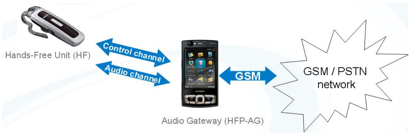
Figure 1: Typical HFP use case

Hands-Free profile v.1.5 and older support 8kHz, 8-bit audio and Hands-Free profile v.1.6 support 16kHz and 8-bit audio also known as Wide Band Speech or HD Voice.