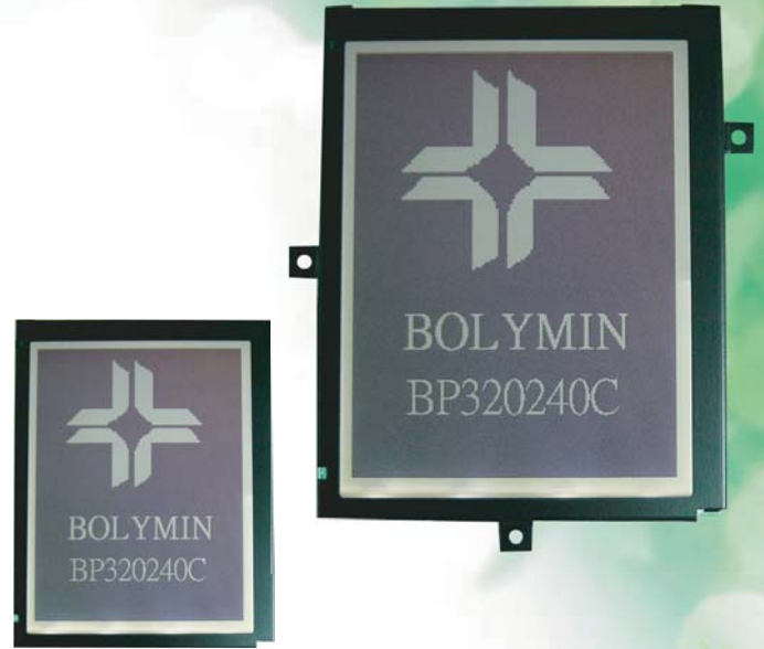
(Options : Frame without ears)