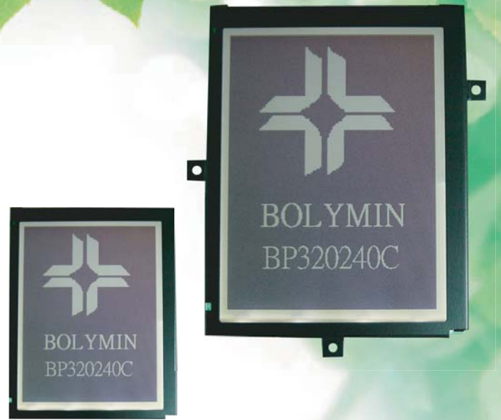
(Options : Frame without ears)