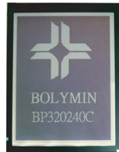
(Options : Frame without ears)