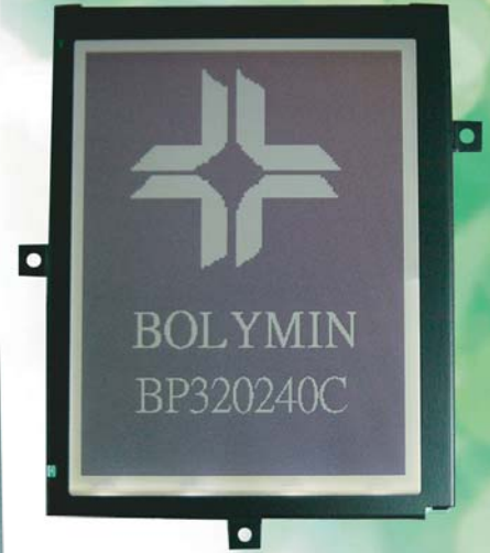
(Options : Frame without ears)