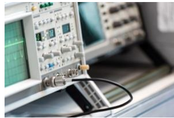
Testing & Measurement Equipment