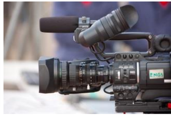
HD Video Cameras