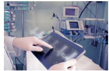
Non-Invasive Medical Electronic Equipment